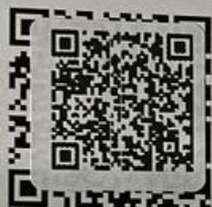
QR Code for Android Phone